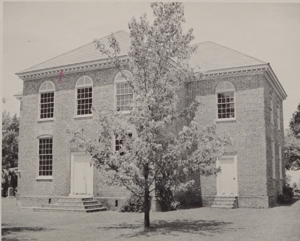
SAINT PAUL'S CHURCH Built 1766