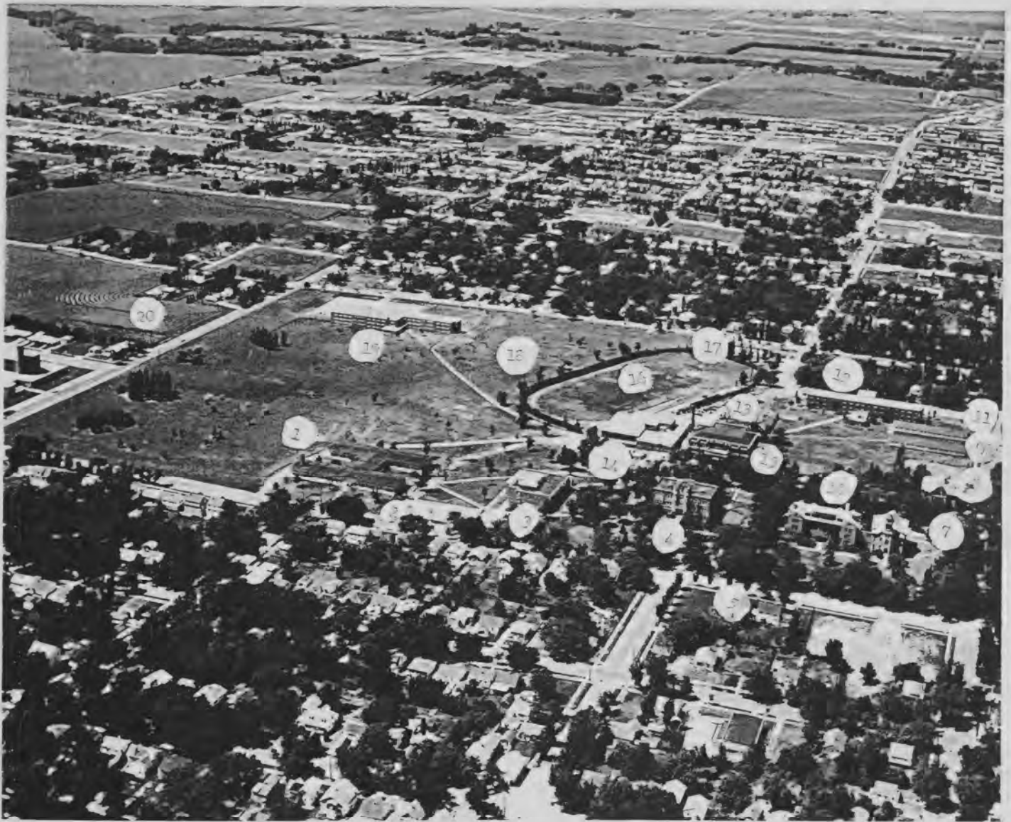
THE AUGUSTANA CAMPUS