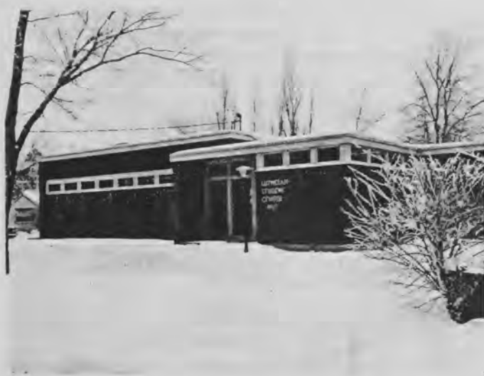
Lutheran Student Center located near South Dakota State College, Brookings, South Dakota.

of $100 per year. It was revealed that about 1600 students of Lutheran background were in this category.