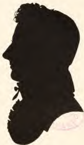
HARRIS e ABBE