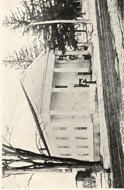
THE TOWN HALL OF ENFIELD (Used as the Meeting House, 1775-1818)