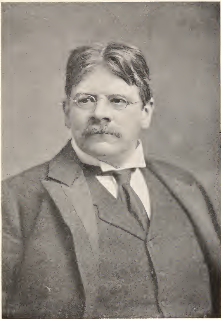
EDWIN AUSTIN 8 ABBEY, R.A.; AMERICAN PAINTER, DECORATOR AND ILLUSTRATOR