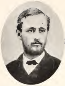
WILLIAM COLGATE'S ABBE