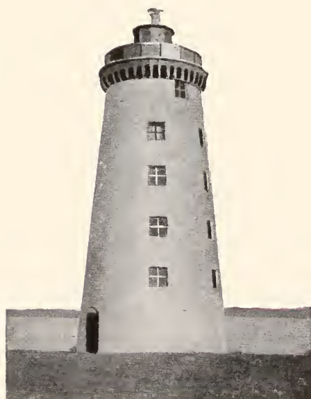
OLD WINDMILL NEAR PRESCOTT CONVERTED INTO A LIGHTHOUSE BY THE CANADIAN GOVERNMENT