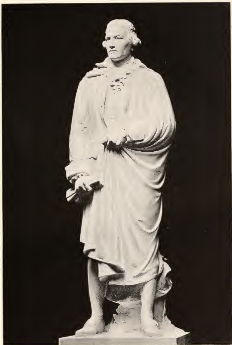
THE STATUE OF CAPTAIN THOMAS' ABBEY