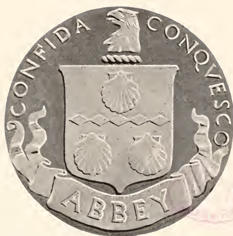
AN ENGLISH ABBEY COAT OF ARMS