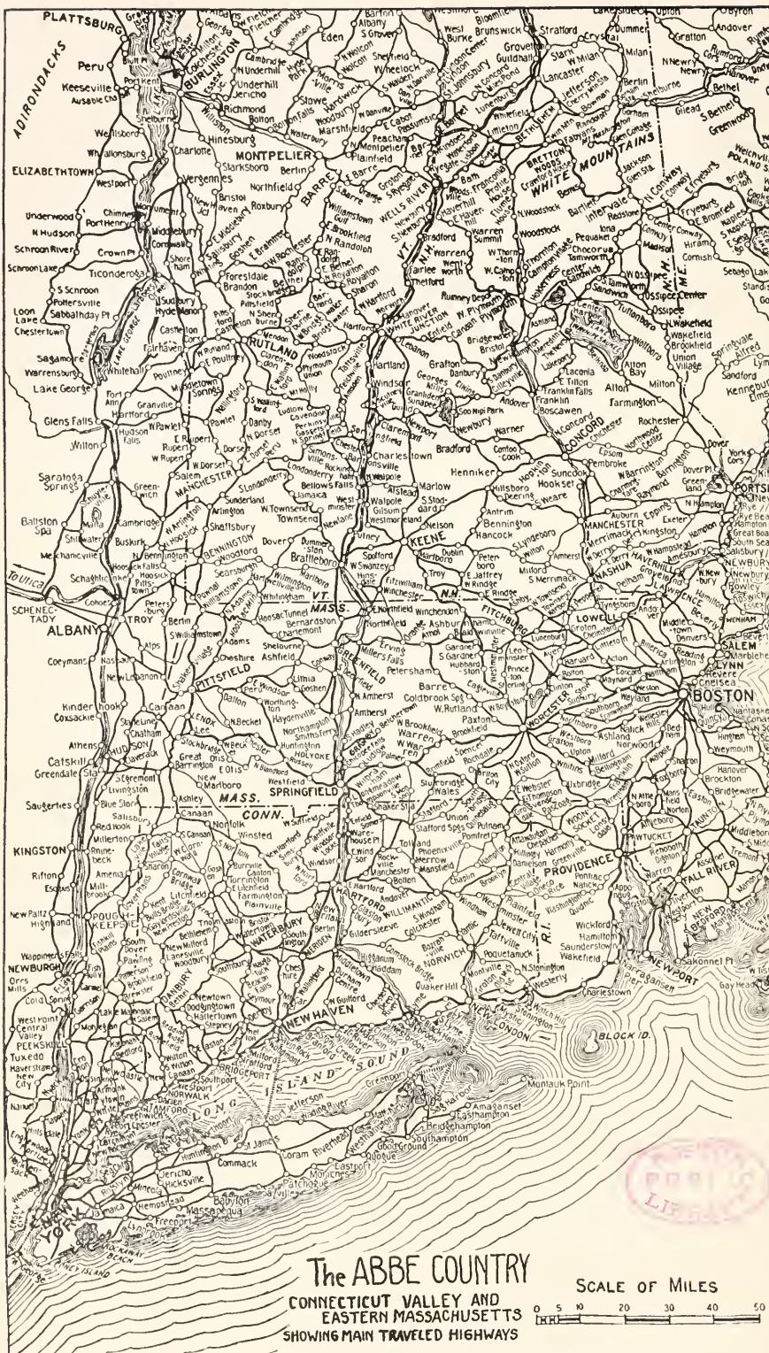
The ABBE COUNTRY CONNECTICUT VALLEY AND EASTERN MASSACHUSETTS SHOWING MAIN TRAVELED HIGHWAYS